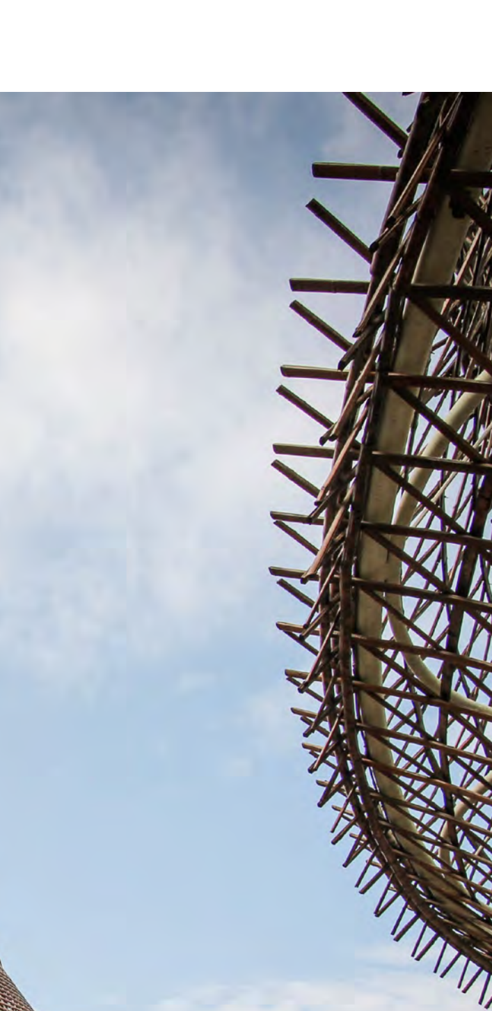
afforded by a part of the world's population. We build the same way in Asia or Africa as we do in Europe: making the best out of locally existing, natural materials. There

HEDGEHOG OF ARCHILOCHUS Against scattered knowledge, To delve into the necessary